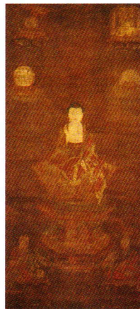
The Three Venerable Ones of Ordination Shōjuraikōji Kamakura Period