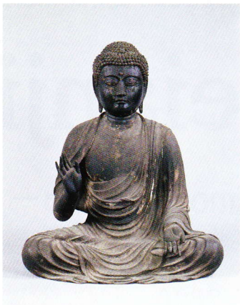
Seated Shaka Nyorai (Buddha Śakyamuni) Shōjuraikōji Kamakura Period, Important Cultural Property