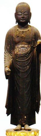
Standing Jizō Bosatsu (Bodhisattva Ksitigarbha) Seianji Kamakura Period, Ōtsu City-designated Cultural Property