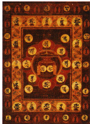
Seed-syllable Mandala of the Lotus Sutra Shōjuraikōji Kamakura Period, First Public Exhibition