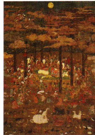
Death of the Buddha Seianji Muromachi Period