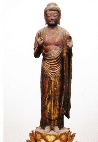
Standing Amida Nyorai (Buddha Amitābha) Seianji Kamakura Period