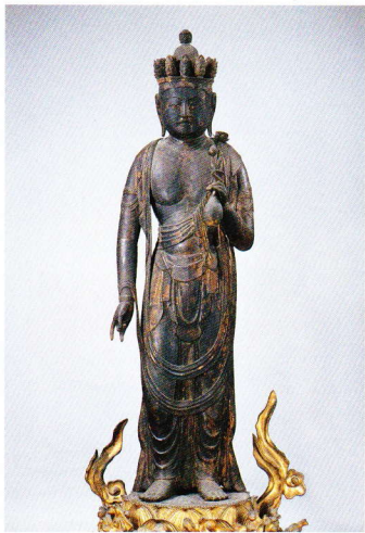
Standing Eleven-headed Kannon Shōjuraikōji Heian Period, Important Cultural Property